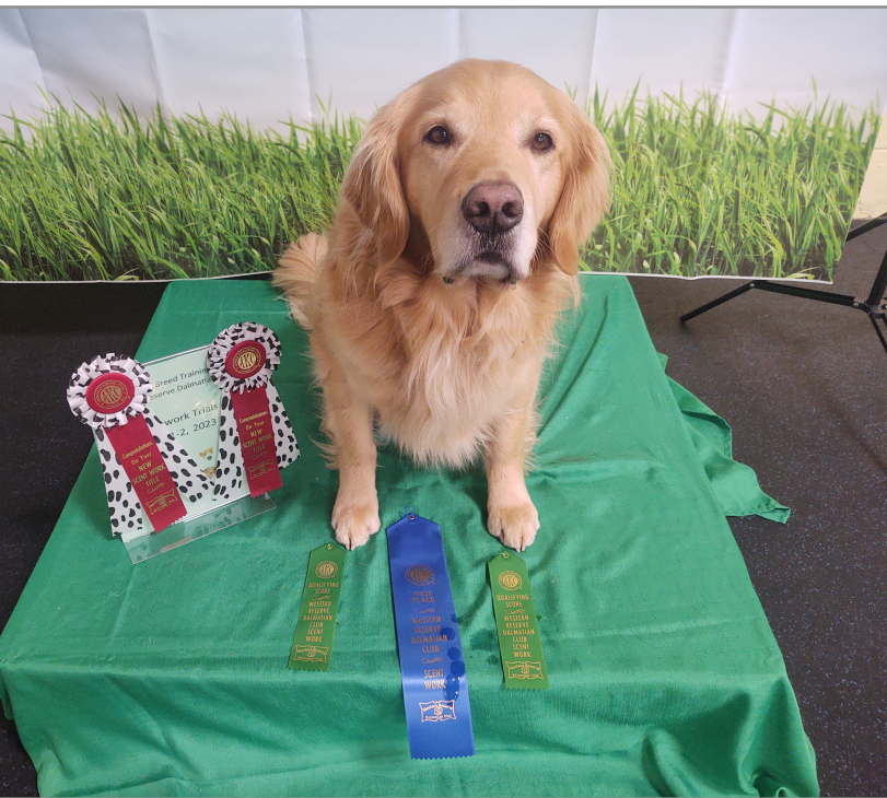
Bend earned his advanced scent titles in container (SCA) and interiors (SIA) at the Dalmatian show.