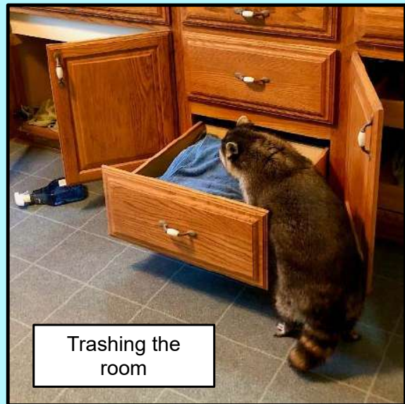
Trashing the room