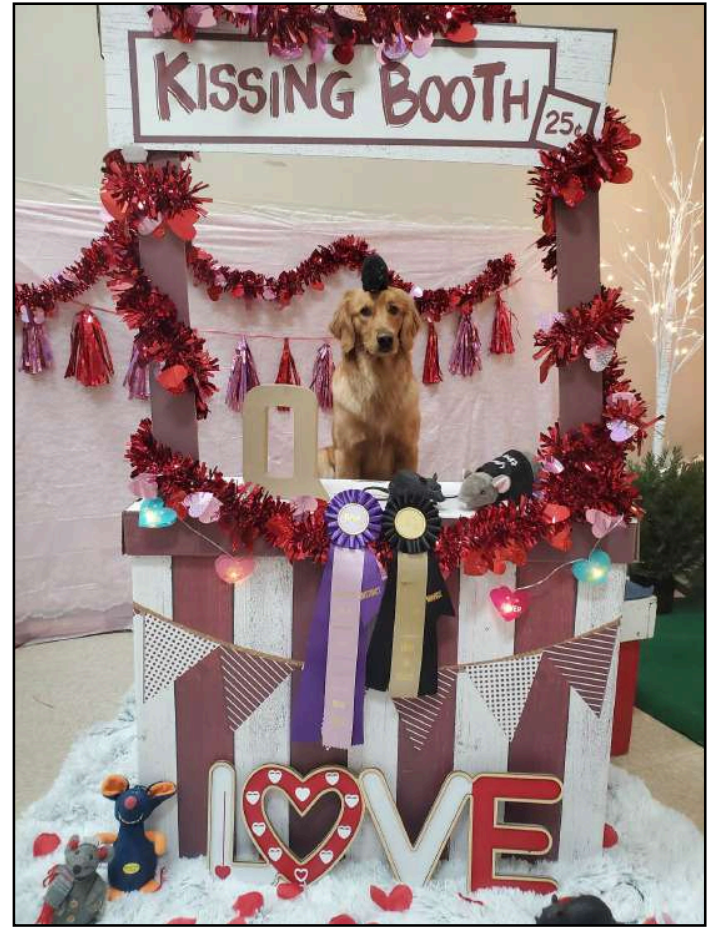
Violet got her RATN title with 2 of the 3 runs being high in trial runs! ~Micayla Mingus