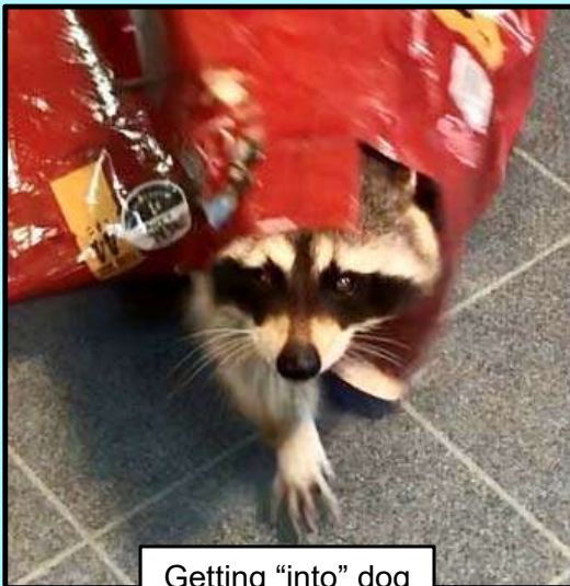
Getting "into" dog food bags