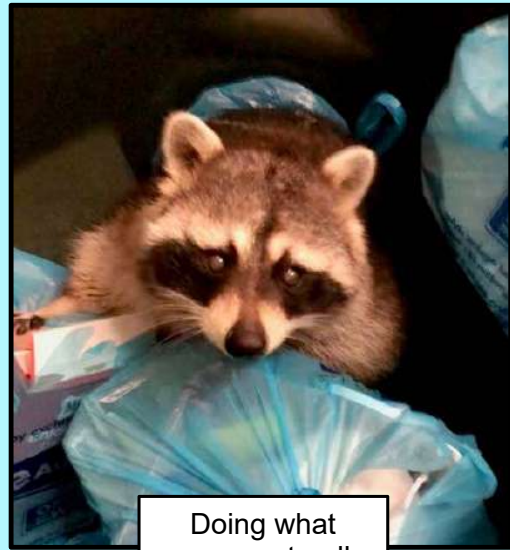
Doing what comes naturally