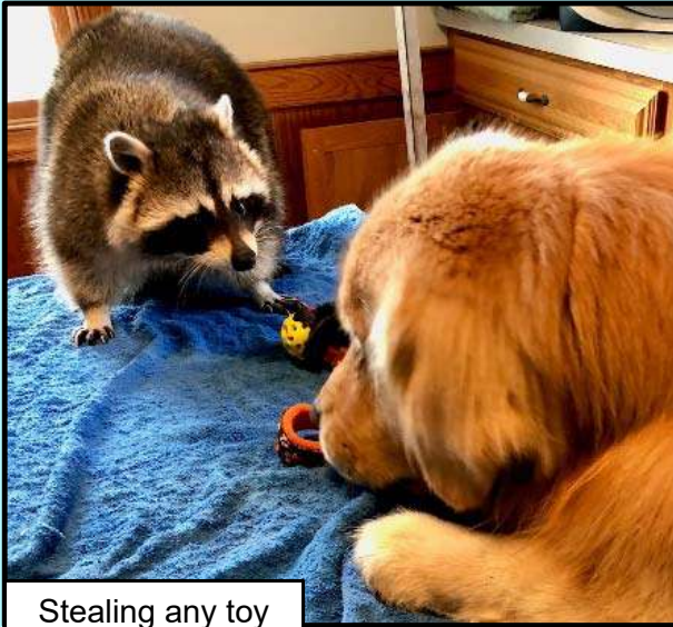
Stealing any toy he wants