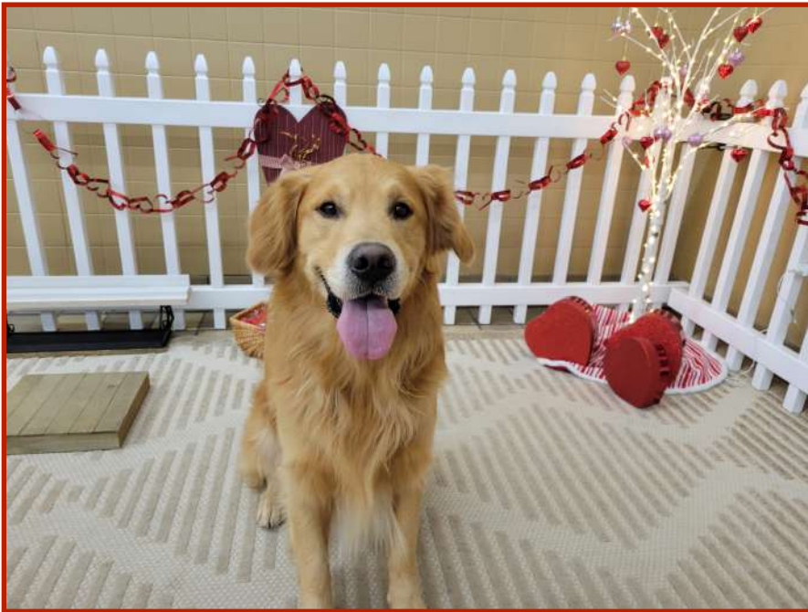
Punch did a very nice job and earned his Excellent Jumper with Weaves title on February 5 at Pinnacle. Woohoo! On to Master!