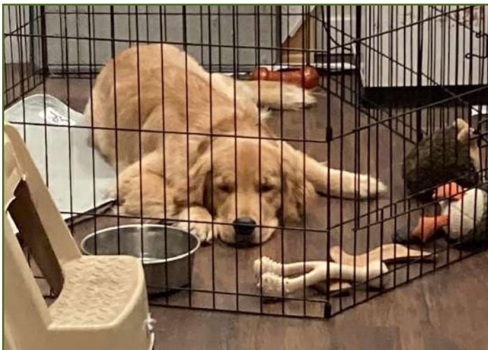
On Feb. 22, Spirit will turn three. He is my silly boy who loves to run around barking. He loves to race me out the door or up the stairs and is an all around little clown.

Go Skyefire Forever in My Heart CD JH WC CCA