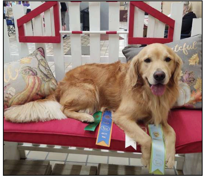
Bend earned his Novice Fast title at the Clumber Agility trial