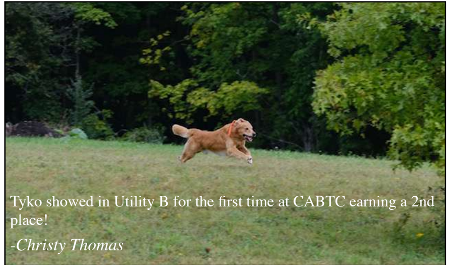
Tyko showed in Utility B for the first time at CABTC earning a 2nd place!