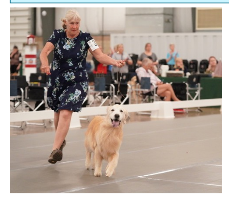
Me doing my best not to fall! https://www.cvgrc.org/