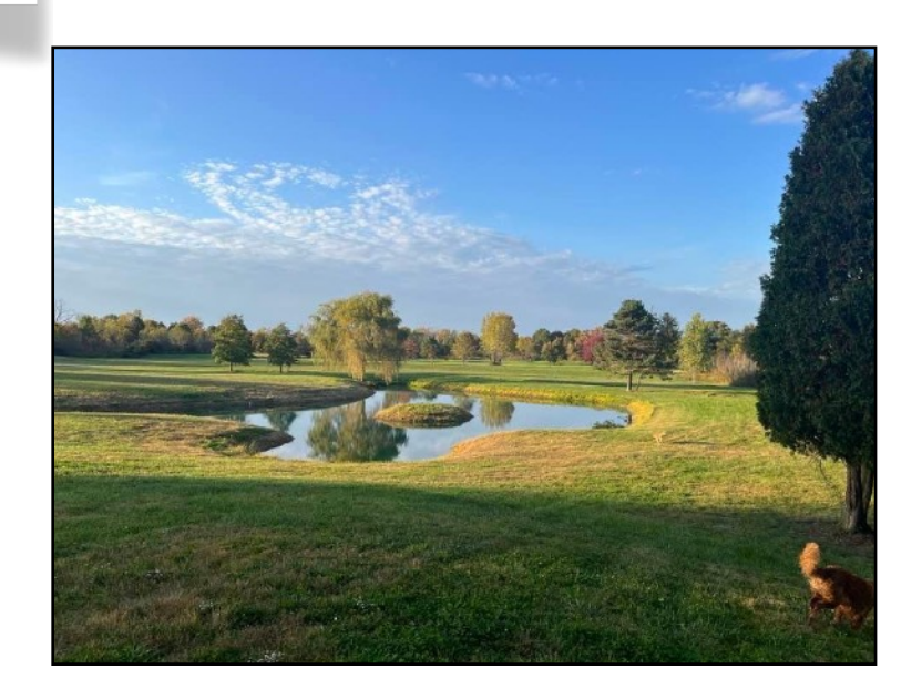
Yard and pond renovations