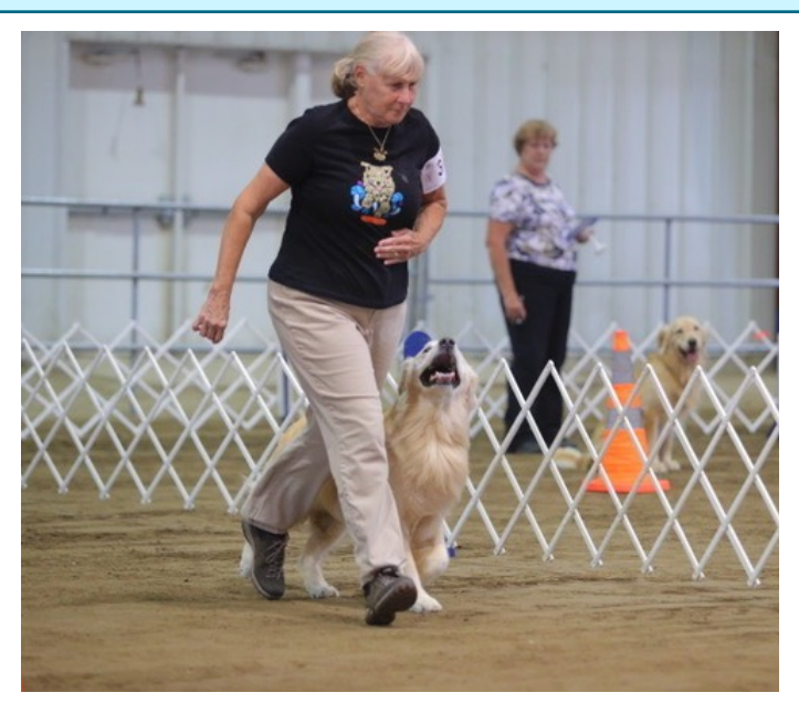
Heeling with Beau-D is like doing a dance!