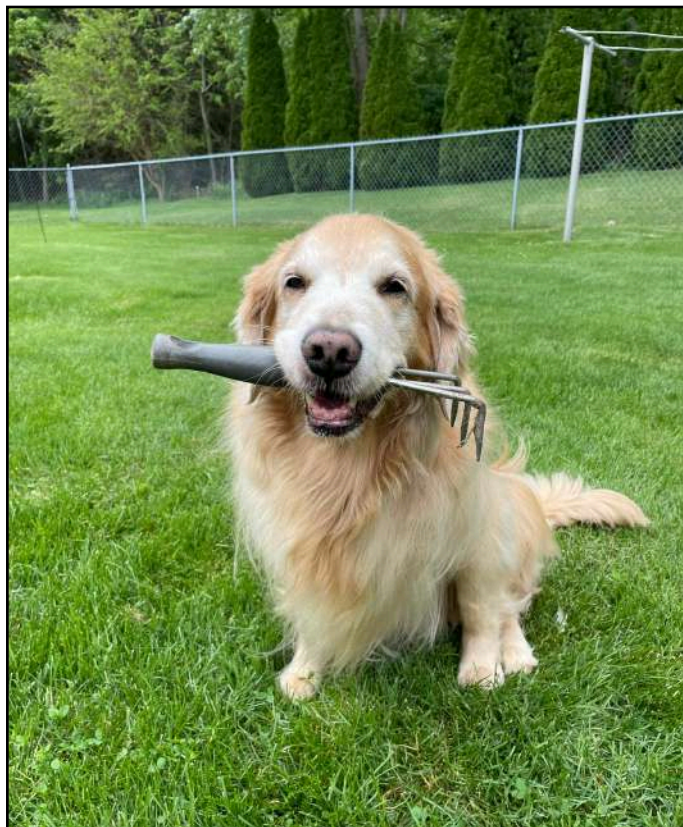
Flash helping me water and plant. -Karen Laber