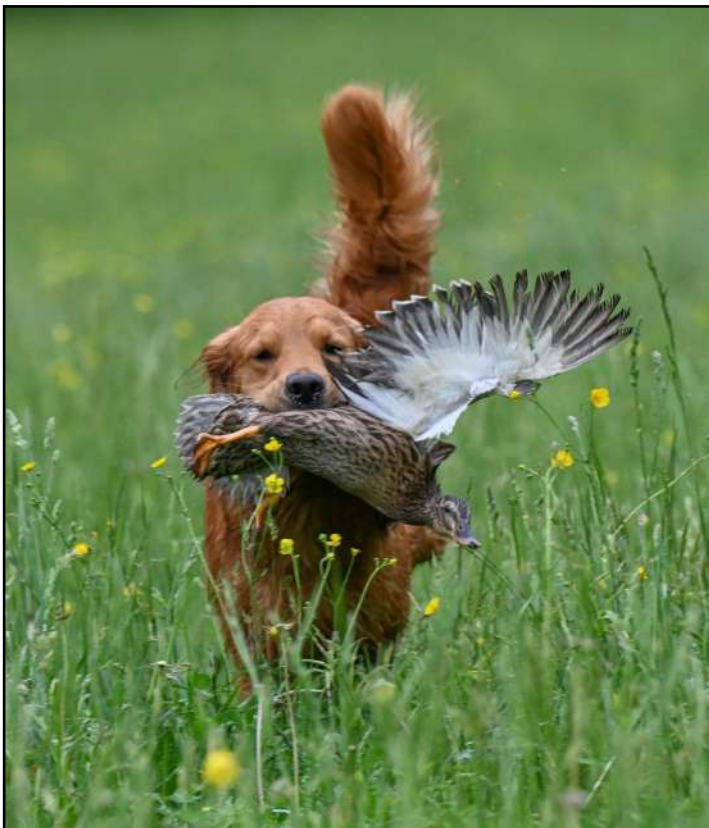
Fun live flyer training day!!! Cash took his live retrieve for a ride back to the line!!