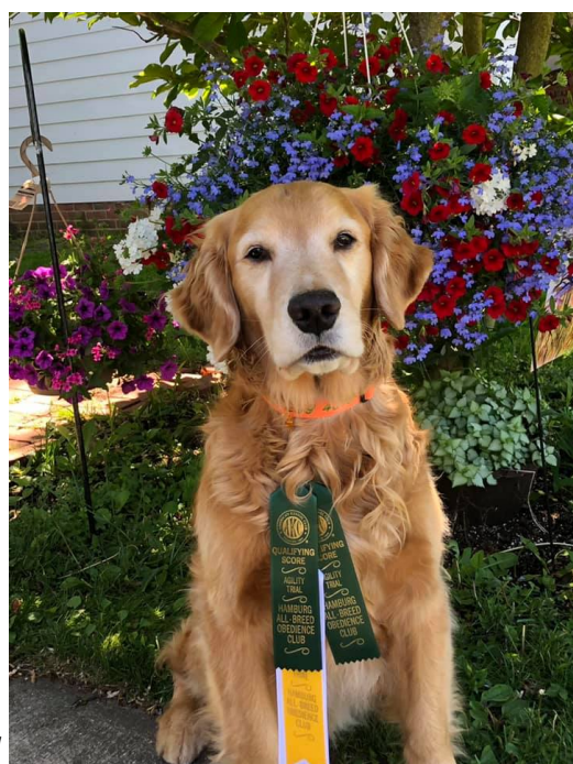
Score earned his QQ for the 2022 Nationals!!