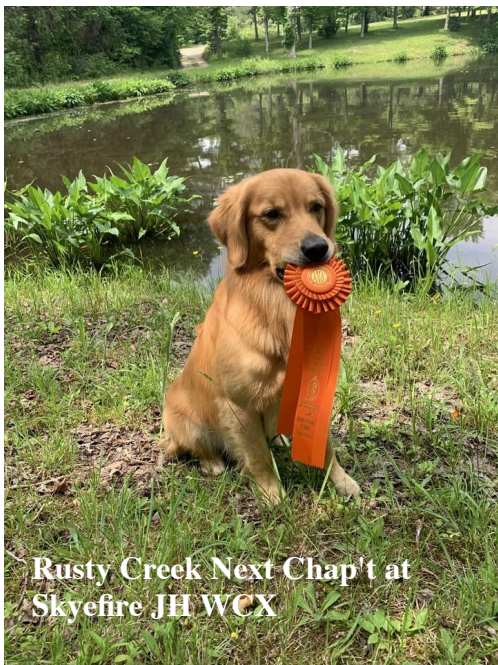
Rusty Creek Next Chap't at Skyefire JH WCX

And on Sunday at the CVGRC Hunt Test, Tyko earned his 3rd SH pass, going 3 for 3! He ran two really nice blinds and pinned the marks! He is such a serious fella when doing his field work!