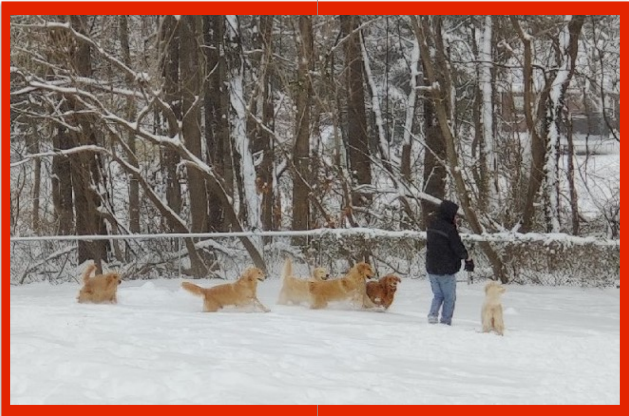
The Broomfield's Christmas Romp 2020